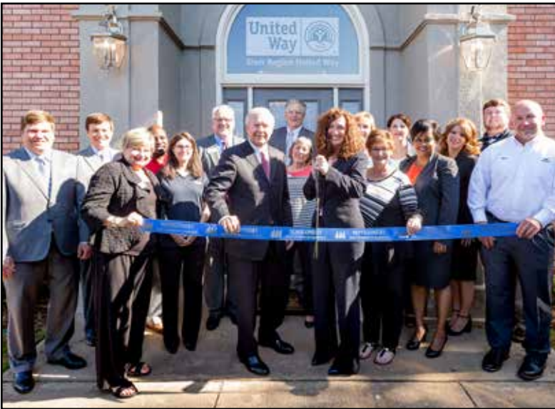
Following the RRUW Annual Meeting on May 16, 2017, a ribbon cutting and open house was held at the United Way offices at 3121 Zelda Court in Montgomery.