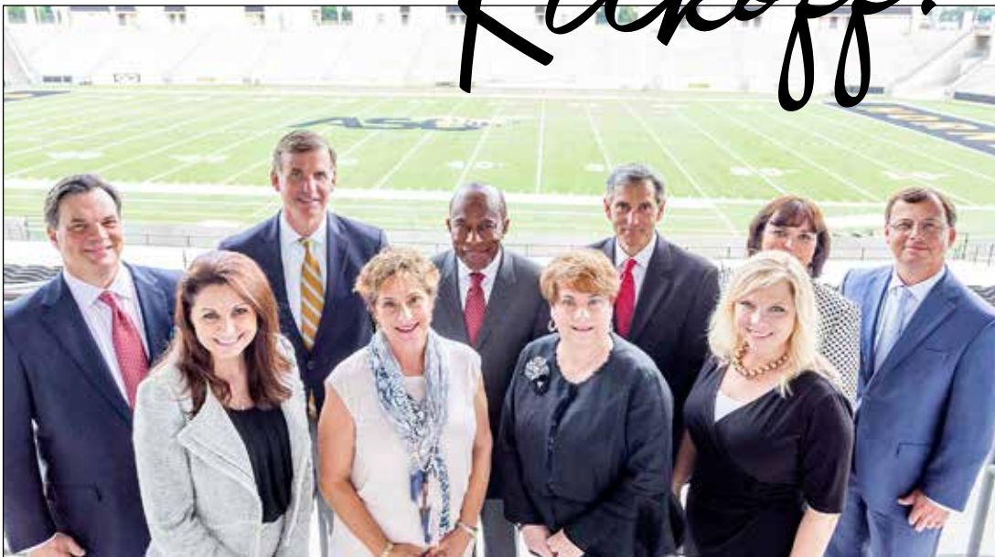
2018 Campaign Cabinet members at an orientation and training event hosted by ASU.